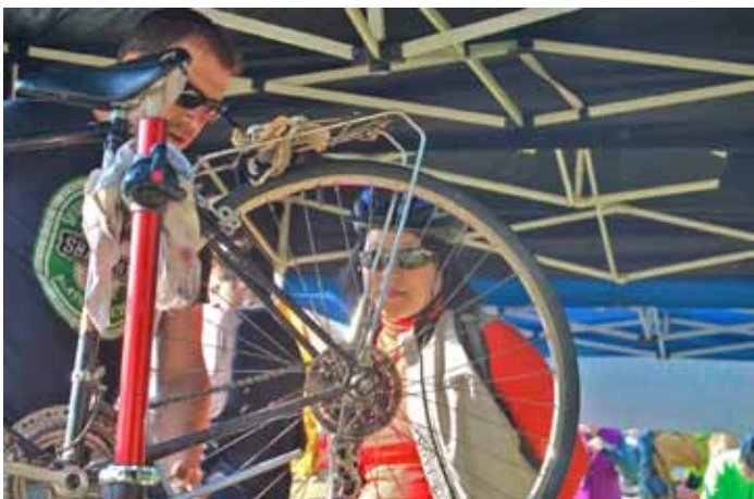
Bike Mechanic checks out a rider's bike at BTWW Celebration Station

Metro Vancouver saw 900 brand new commuter cyclists start biking due to Bike to Work Week in 2011.