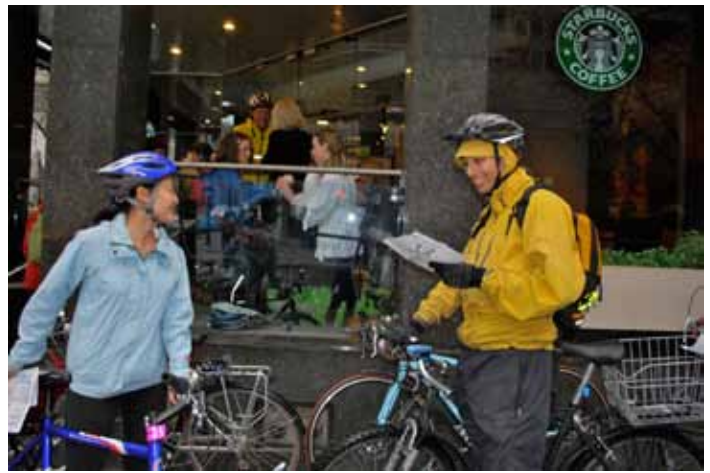
Discover Downtown by Bike Launch – April 2011

The VACC continues to receive tremendous support and assistance from our dedicated volunteers. Volunteers help run the Bike to Work Week commuter stations, are the face of the VACC at numerous community events and festivals, help out in the office on Volunteer Nights, and tirelessly helped move cycling advocacy forward through our Board, Local Advocacy Committees and other VACC activities. We are extremely grateful to all our volunteers.