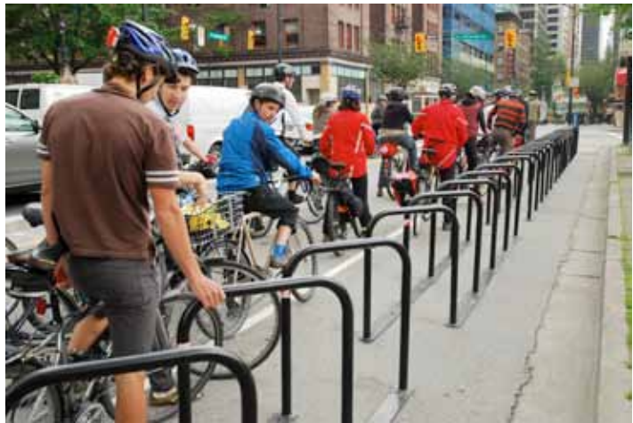
Cyclists ride Dunsmuir separated lane and admire new bike racks

The Advocacy Advisory Committee (AAC) was reinvigorated in April with members meeting every 4th Thursday at the VACC office. The ultimate goal of the group is to have a list of policy statements that will be posted to the VACC website and available for reference when people want to know where