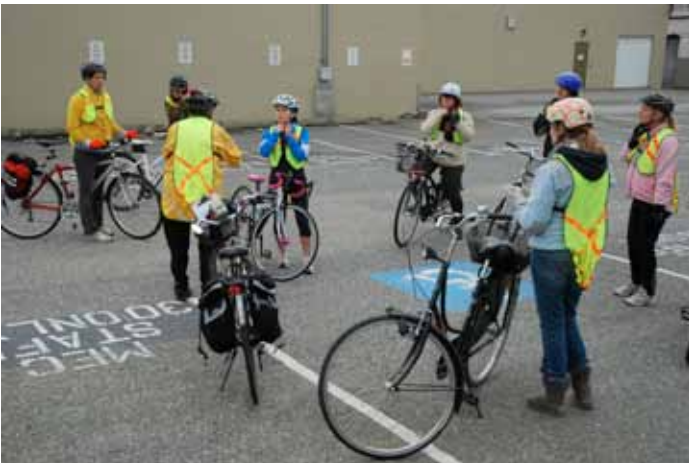
Participants learning the ropes at a Streetwise Cycling course