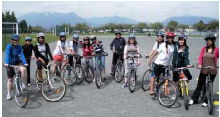
Students taking Bike to School training with the VACC